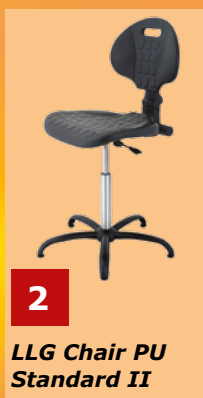
2 LLG Chair PU Standard II