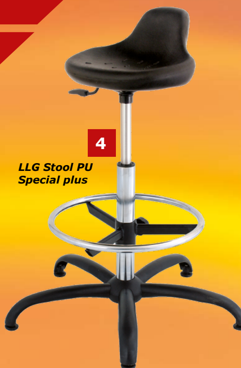
4 LLG Stool PU Special plus