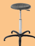
6 LLG Stool PU Standard