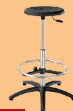
5 LLG Stool PU Standard plus