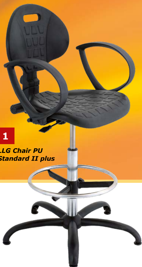
1 LLG Chair PU Standard II plus