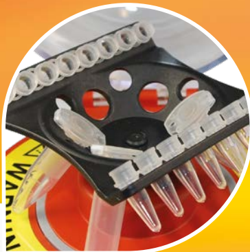
LLG-uniCFUGE 2 with universal rotor