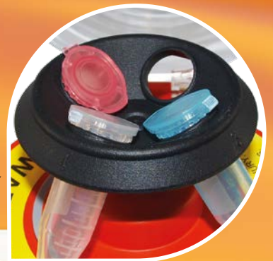
LLG-uniCFUGE 2/5 with rotor for 5 ml tubes